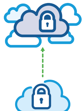
From Your Existing Cloud