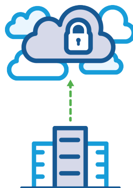
From Your Internal or Managed Hosting

Cloud DR can quickly and simply add native VMware disaster recovery to your VMware platform in your office, data centre or your existing cloud.